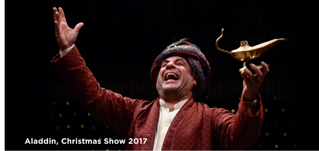
Aladdin, Christmas Show 2017