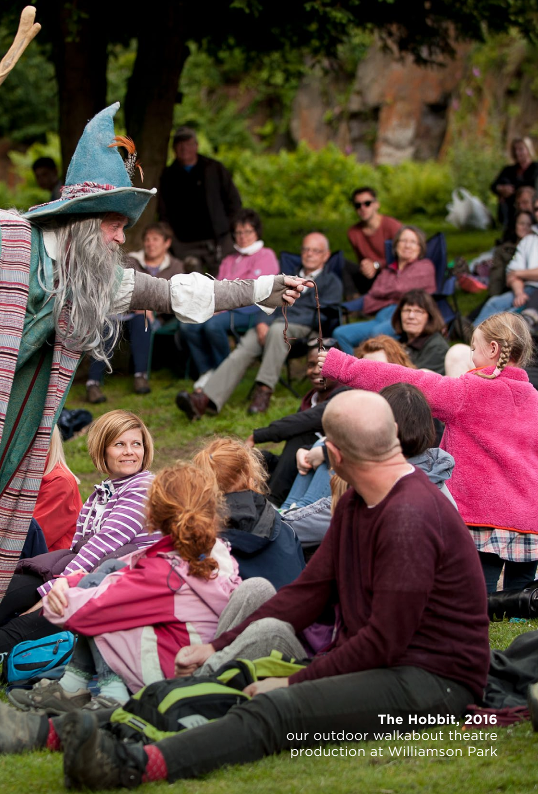
The Hobbit, 2016 our outdoor walkabout theatre production at Williamson Park