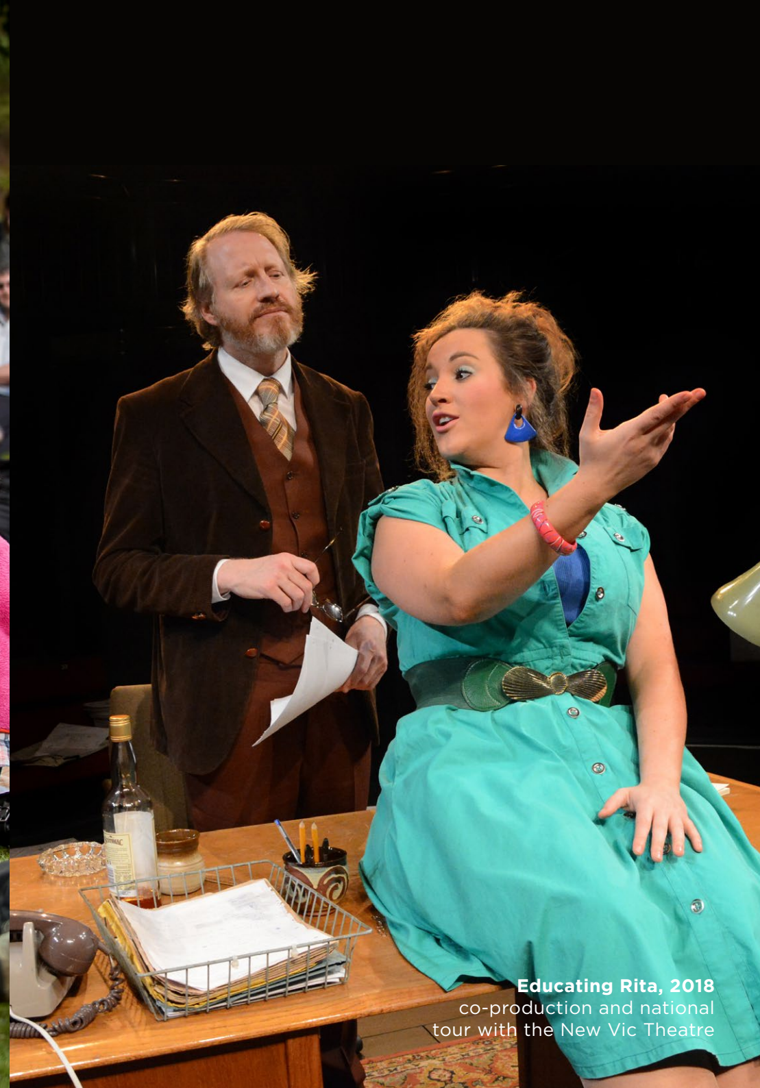
Educating Rita, 2018 co-production and national tour with the New Vic Theatre