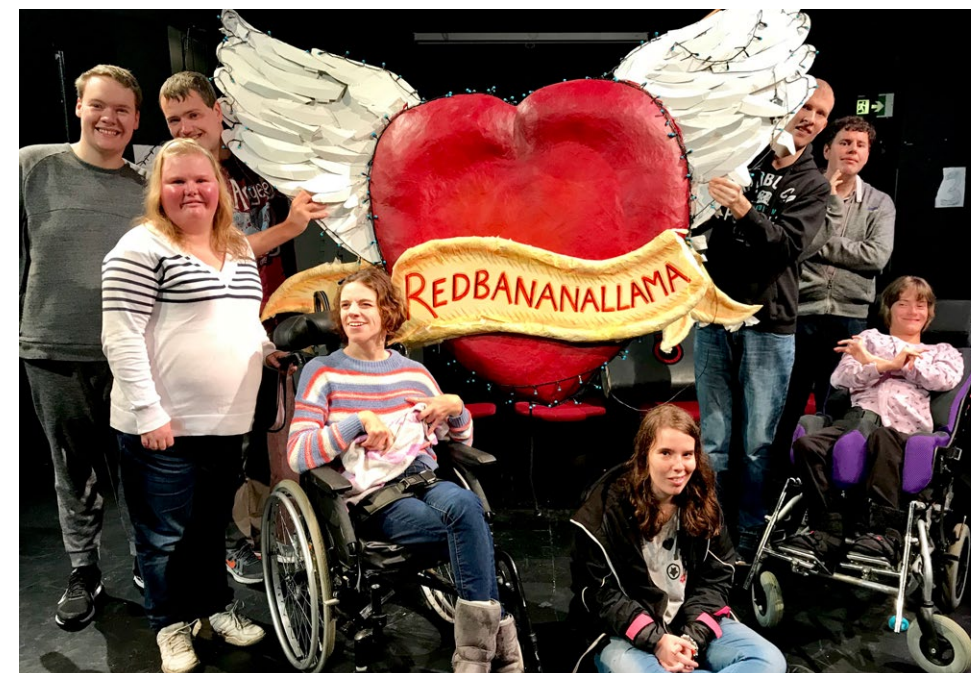
Redbananallama; an adult group with additional needs creating popular inclusive club nights

Share your support further by purchasing a membership for a loved one.